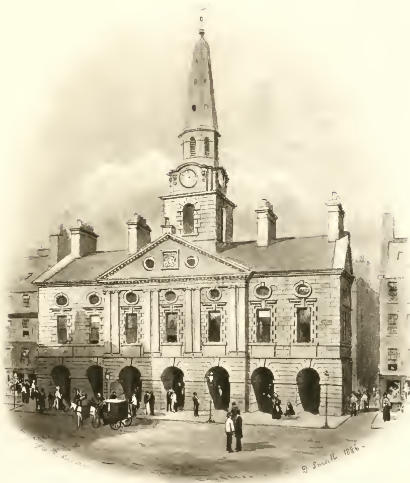
TOWN HOUSE DUNDEE

PUBLISHED BY ORDER OF THE FREE-BORN MAGISTRATES AND TOWN COUNCIL, DUNDEE, 1886.